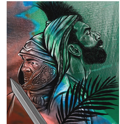
"Which parade would you follow? Jesus or Pilate?"