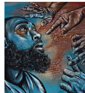
"Who sinned, this man or his parents that he was born blind?"

" A Sanctified Art " ( sanctifiedart.org ) is a ministry created in 2016 by a team of pastors and artists to integrate creativity into spiritual practice. We have employed their gifts in past liturgical seasons, and have turned to them to help us "fast" from our assumptions and certainties. Their questions have shaped our worship, our Wednesday night Lenten programs, and the devotional booklet featuring reflections from our own talented church members (don't forget to pick up a copy in the narthex!).