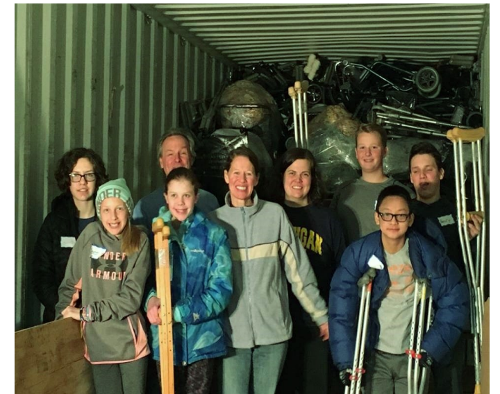
Our Youth Group also attended UISR one month later.

The greatest lesson we all came home with was that charity alone is not enough. We